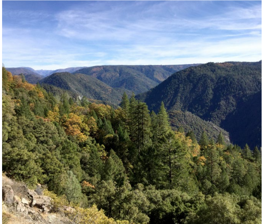
Above: Situated on Moody Ridge, the property offers breathtaking canyon views.

This is a vital opportunity to protect a contiguous stretch of scenic ridge top land and watershed, as Moody Ridge is already under pressure of development into residential property. Our goal is that this preserve will become a nucleus for more ridgetop protection in this area!