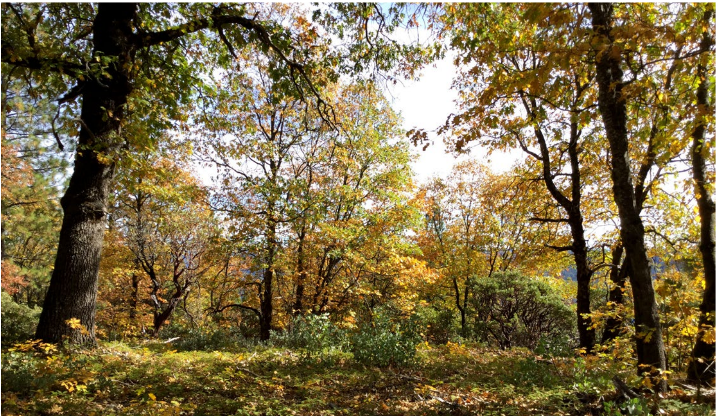
Below: Mature oak forest provides abundant wildlife habitat.