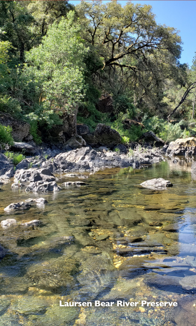
Laursen Bear River Preserve