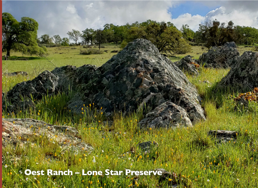
Oest Ranch – Lone Star Preserve