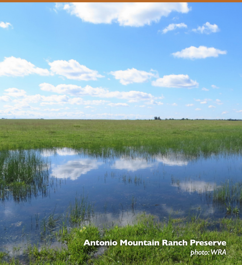
Antonio Mountain Ranch Preserve

Placer Land Trust staff members work continually to maintain and restore our preserves, and monitor our conservation easements to ensure that these properties are being kept in excellent condition. Sustainability is key to our work — we are dedicated to ensuring that these lands will be protected and maintained forever. And with the support of our members, we look forward to the challenge and the privilege of caring for even more land in the future!