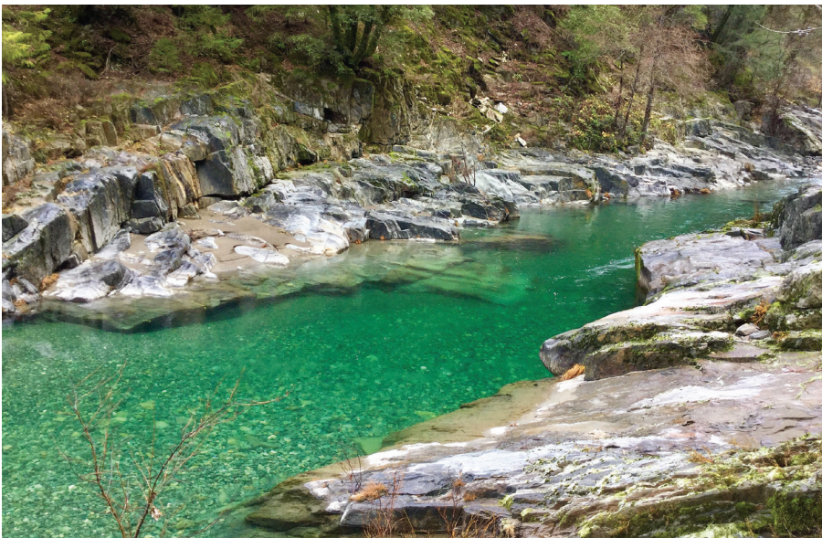
Above: Southern Cross Preserve is located in one of the most scenic sections of the North Fork canyon.

Cart tracks are still visible between the mine openings, and the remnants of a 5-acre millsite are located nearby on USFS land. An environmental site assessment at the mine and millsite concluded there was no contamination from heavy metals, or environmental issues of concern. However, safety issues are a concern due to instability and lack of ventilation, and entry to the mine is prohibited.