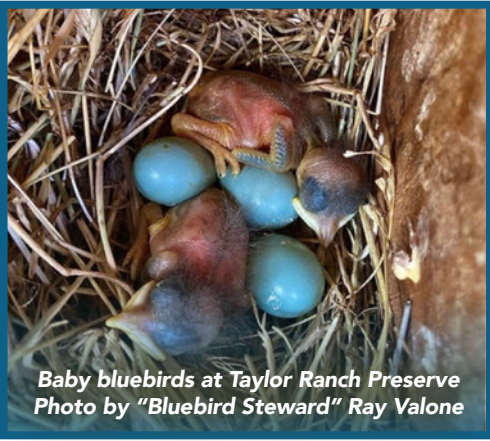
Baby bluebirds at Taylor Ranch Preserve