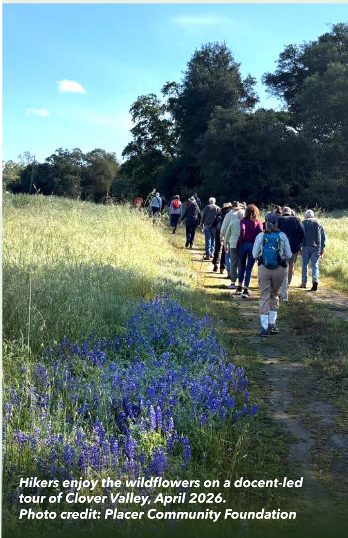
Hikers enjoy the wildflowers on a docent-led tour of Clover Valley, April 2026.

The 0.8-mile trail will lead from the entrance parking lot to the Raccoon Creek Overlook, an open viewing deck with a great view of Raccoon Creek only 50 feet below. We believe everyone should have the opportunity to experience the physical and mental benefits of spending time in nature, and we are grateful to the Kelly Foundation for helping us make this vision a reality!