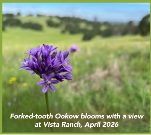
Forked-tooth Ookow blooms with a view at Vista Ranch, April 2026